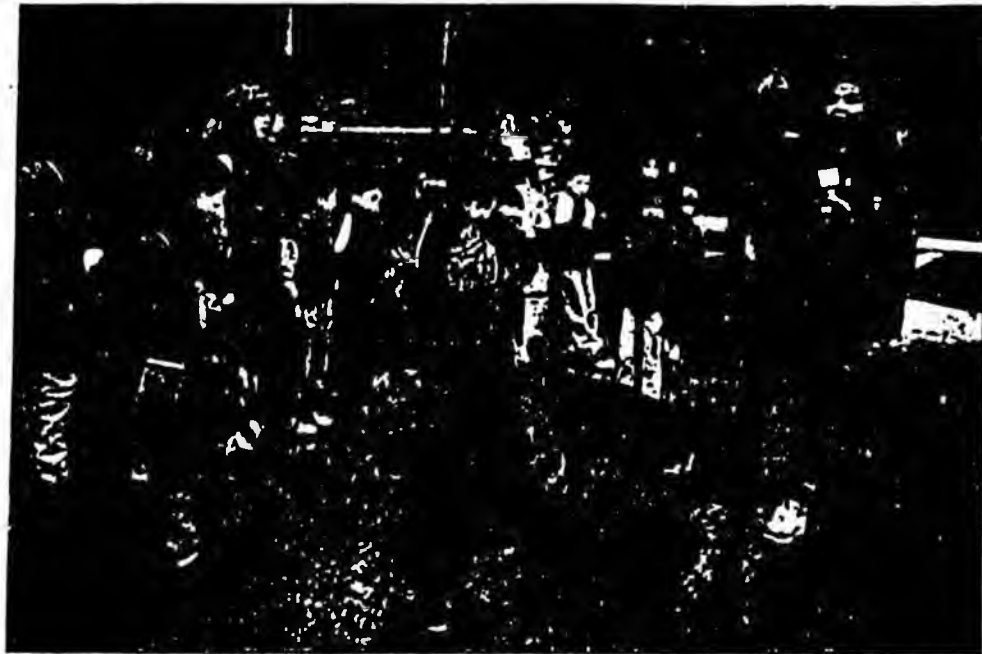
Icy spot: Delores Wheaton, right, counts heads this morning at a bus stop on Cordova Street at Douglas Highway, where children have been falling on steep, icy sidewalks.

Along with reports of five gun Please see Drive-by, Page 8