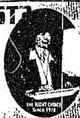
THE RIGHT CHOICE Since 1978