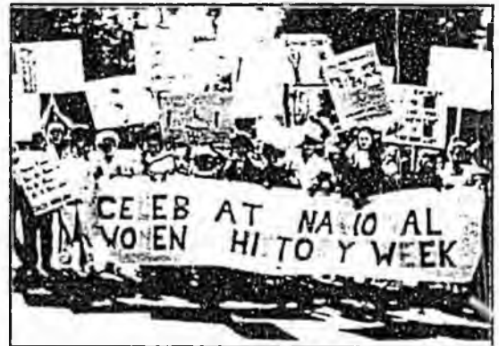
Joaquin Miller Elementary School (Oakland, CA) was one of the first to celebrate Women's History Week.

Women's History Week celebration, they liked the idea so much they decided to encourage their own organizations and school districts to initiate similar celebrations. The group also agreed to support our efforts to