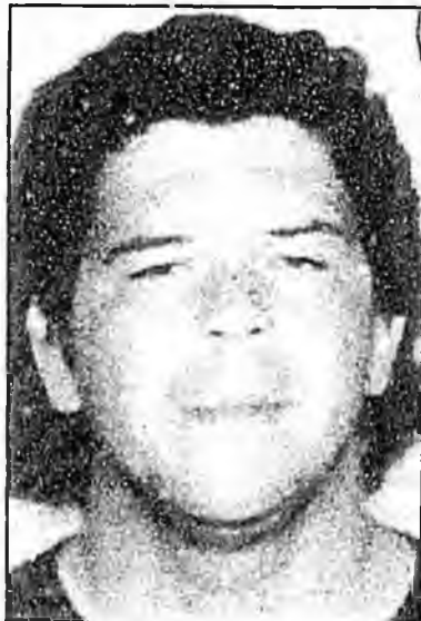
Special to the News

Meanwhile, he made several trips between the resi-