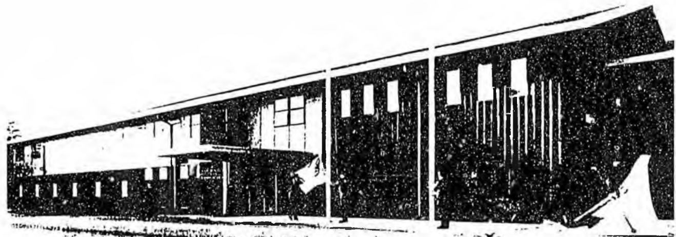
Alaska Public Safety Academy, Sitka, Alaska

Course covers preparation of D.W.I. Enforcement, drinking drivers and driving, the D.W.I. Statute, issues and defenses, pharmacology and toxicology, theory and operation of the intoximeter, courtroom testimony, and case preparation. Accident investigation techniques and field exercises are included.