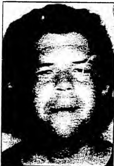
Special to the News

Meanwhile, he made several trips between the resi-