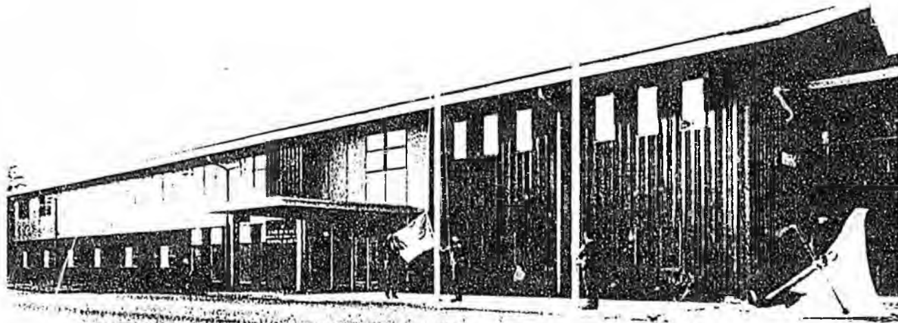
Alaska Public Safety Academy, Sitka, Alaska

Course covers preparation of D.W.I. Enforcement, drinking drivers and driving, the D.W.I. Statute, issues and defenses, pharmacology and toxicology, theory and operation of the intoximeter, courtroom testimony, and case preparation. Accident investigation techniques and field exercises are included.