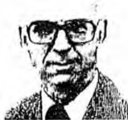
David S. Broder