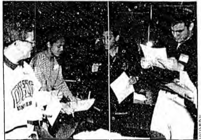
Students learn to understand and appreciate each others' racial and ethnic experiences at a leadership conference sponsored by A World of Difference.