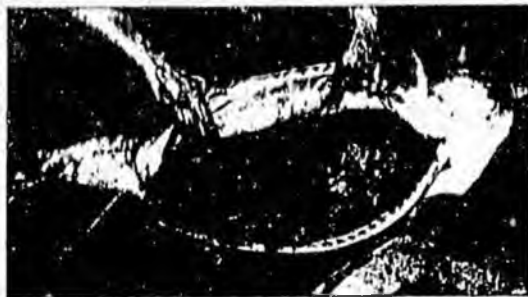
American-style caviar—eggs from the rare freshwater paddlefish—was seized in 1989 in Missouri, where commercial taking of paddlefish is illegal but seductively lucrative: The roe from a large female may retail for as much as $5,000. Sentencing three defendants in this case, a federal judge said, "We can no longer tolerate the destruction of our nation's natural resources for the short-term profit of a few."