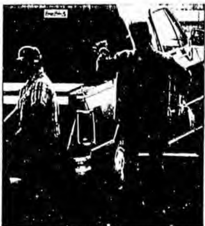
ROYALTY'S ALLEGEDLY INTERFERED WITH THE HUNTERS' DEPARTURE.