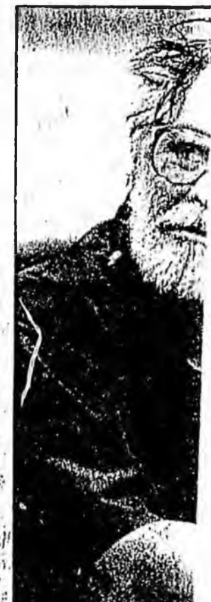
Murder suspect Ch...