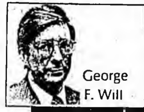
George F. Will