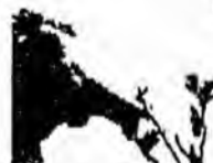
The first rally: a gas