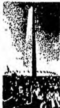
Two decades ago, thousands converged on the Mall in Washington