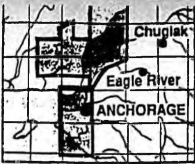
Red indicates lease area.

560,000 acres will be offered for drilling. The areas in lease sale 67-A were selected based upon nominations by oil companies of sites they think have potential. However, the names of the companies and their technical data are confidential. Land within the Mat-Su borough could bring in local revenue through real estate and personal (See Oil page 6)