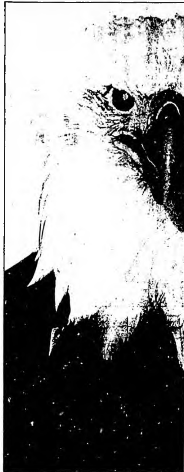
This ailing eagle, recovering at a clinic run by Association, is due to be returned to the wild when it is care of itself, to be given to an educational group. The association has cared for eagles, hawks, seagulls, rav and more photos, Back Page.