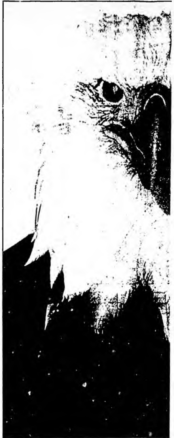
This ailing eagle, recovering at a clinic run by Association, is due to be returned to the wild when it is in care of itself, to be given to an educational group if association has cared for eagles, hawks, seagulls, raven and more photos, Back Page.