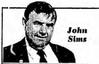
Views expressed here do not necessarily represent those of the Daily News-Miner

The CCT program is administered by the Department of Energy