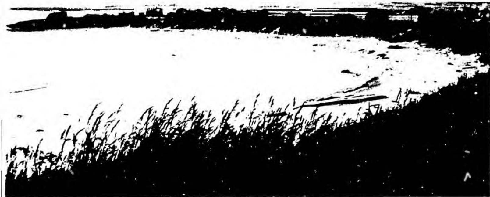
St. Michael, 1975.

High lead concentrations have been discovered in the water systems of the four remote villages of St. Michael, Birch Creek, Gambell and Shishmaref. This paper covers preliminary findings by the state, federal, and local agencies involved, for the purpose of alerting engineers to the problems and how they may best be avoided.