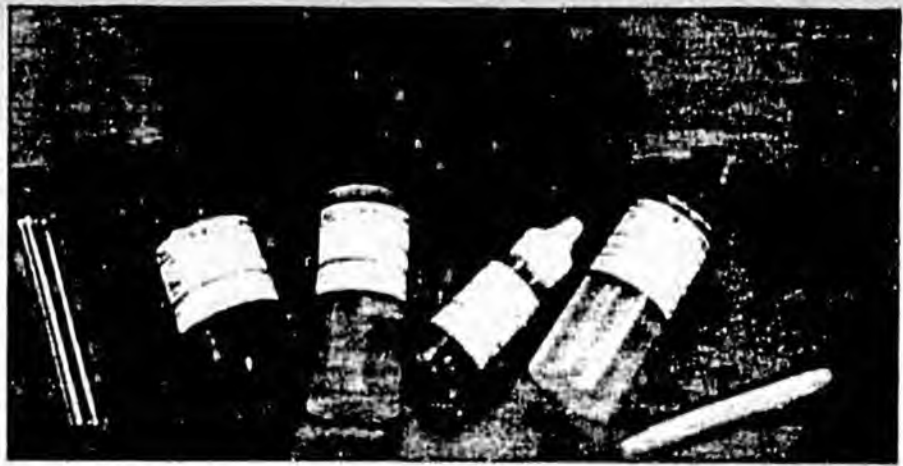
The Portland, Ore., water quality laboratory analyzed 38 samples during the first two years of the statewide lead solder ban. Plumbing inspectors selected sampling sites from 26 locations on the basis of the solder's appearance—50:50 lead solder becomes dull, whereas 95:5 solder remains bright.

commended the use of 95:5 tin-antimony solder for potable water plumbing.