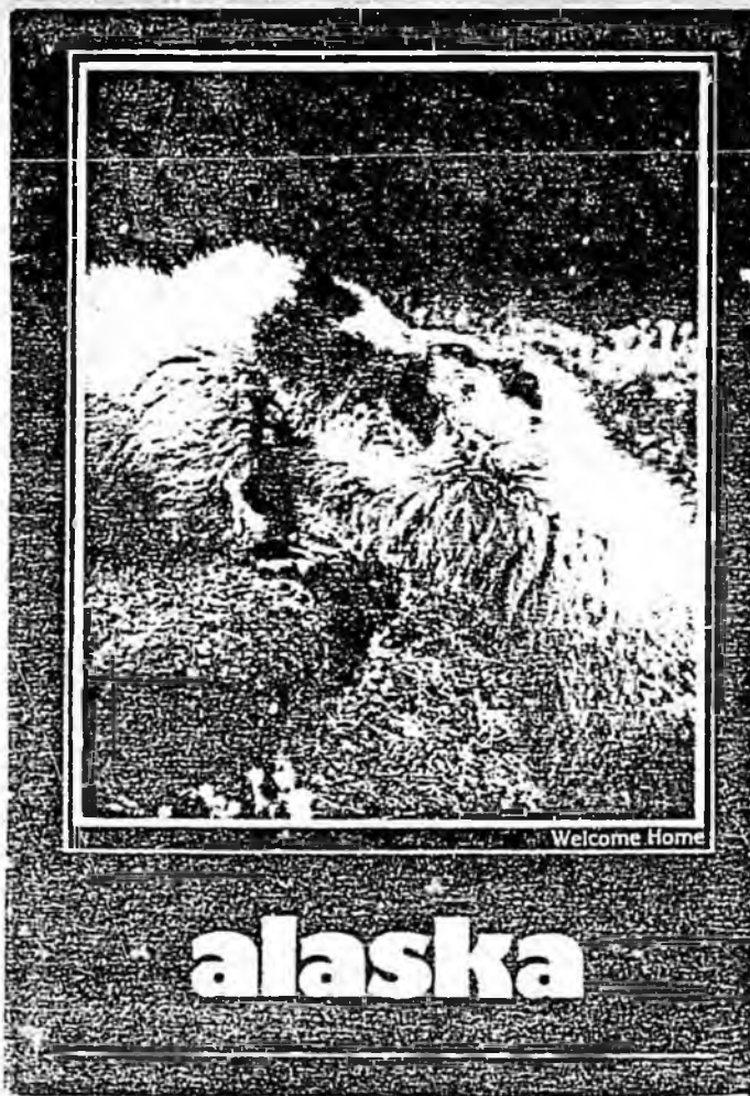
Alaska's marmot. Welcome home. (Marmot photo)

Page 8 The Anchorage Daily News, Friday, March 13, 1987