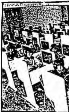
Mt. Edgecumbe sister school in Hefei, China