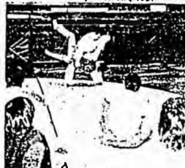
Mr. Hayashi demonstrates his technique to watchful viewers.

Oriental Food: The Japanese diet mainly revolves around what they can catch or grow in the ocean. Fish, for instance, has been the main source of protein in the Japanese diet. Other seafoods are shrimp, salmon, and tuna. They are