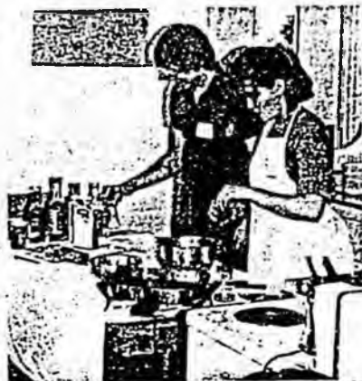
Mary Hudson & Alexander Singh are making Gong Bao GI Ding (Hot & Spicy Chicken)

For the year of 1986, Alaska produced 12.2 to 27.0 billion barrels of oil and an estimated 90 trillion to 167 trillion cubic feet of gas. In the lumber business an average of 20,000 to 100,000 trees were cut and used. About 80% of those trees were traded to other nations. Alaska accounts for 50% of the total amount of fish caught in the U.S. With a wholesome seafood sales in the U.S. With a wholesome seafood sales value of $1 billion. In minerals a total of 28 million tons of coal and 1.5 tons of quartz were mined and since 1800's 30 million ounces of gold, more than a billion pounds of copper, 50 million pounds of lead, and 20 million pounds of silver has been extracted from Alaska mines. Alaska produces 22 out of the 30 minerals purchased from the Pacific Rim countries. In tourism, 800,00 people visited Alaska last year, with a total expenditure of a billion dollars. It is anticipated that by the year 1990, 1 million people will have visited Alaska.