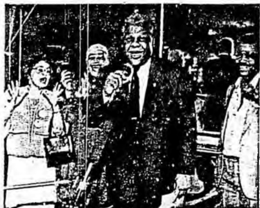
Mayor Washington at a rally with senior citizens