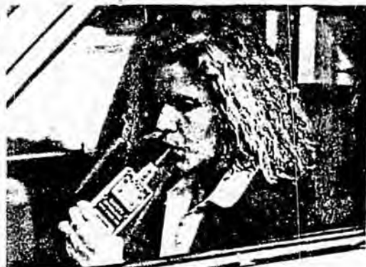
If she had one for the road, her car won't start