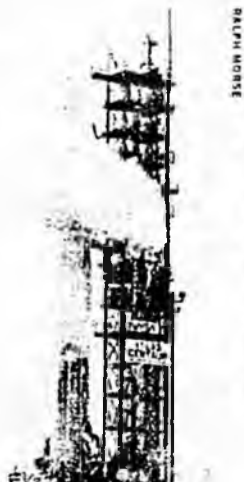
The doomed Atlas-Centaur