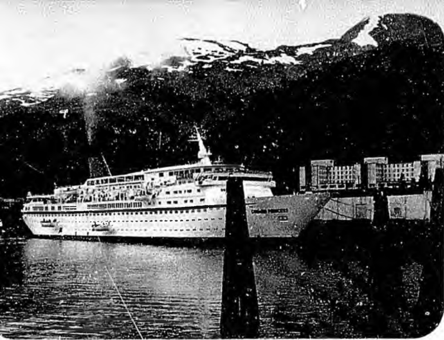
Tourism is expanding dramatically in Prince William Sound. During 1983, seven cruise boats docked in Whittier, 19 in 1984, and 34 are scheduled in 1985.

The construction of Shotgun Cove Road is vital to the total development of the City of Whittier. The road will provide convenient access to the proposed Shotgun Cove Small Boat Harbor, and to the proposed developments within Whittier Subdivision and Shotgun Cove Development area. The road will also provide a myriad of recreational and tourism related uses for the residents and visitors of Southcentral Alaska.