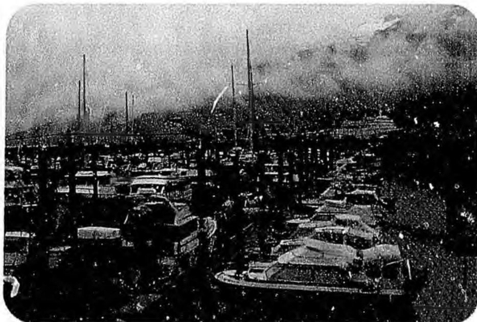
Existing Whittier Small Boat Harbor. There is presently a waiting list of 350 who wish to berth their boats in Whittier.