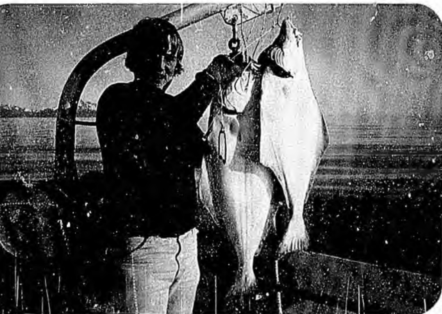
Salmon and shrimp fishing, shrimping, and crabbing opportunities abound in Prince William Sound.