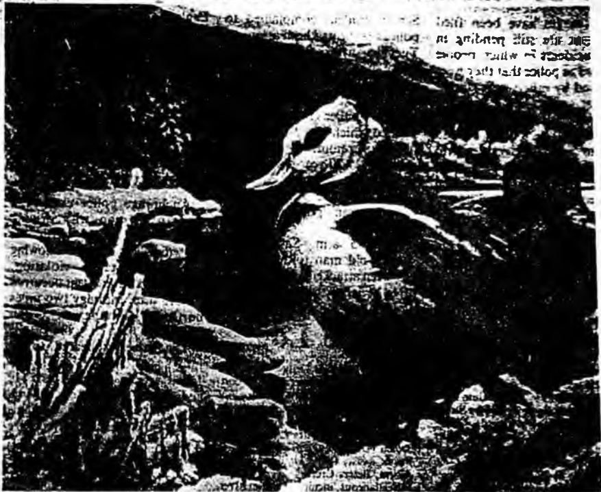
Peters Creek residents think this painting of Stellar Eiders by a local artist should have been selected for the state's 1986 duck stamp, instead of a painting by a Minnesota artist — and they've written Gov. Sheffield a letter saying just that.