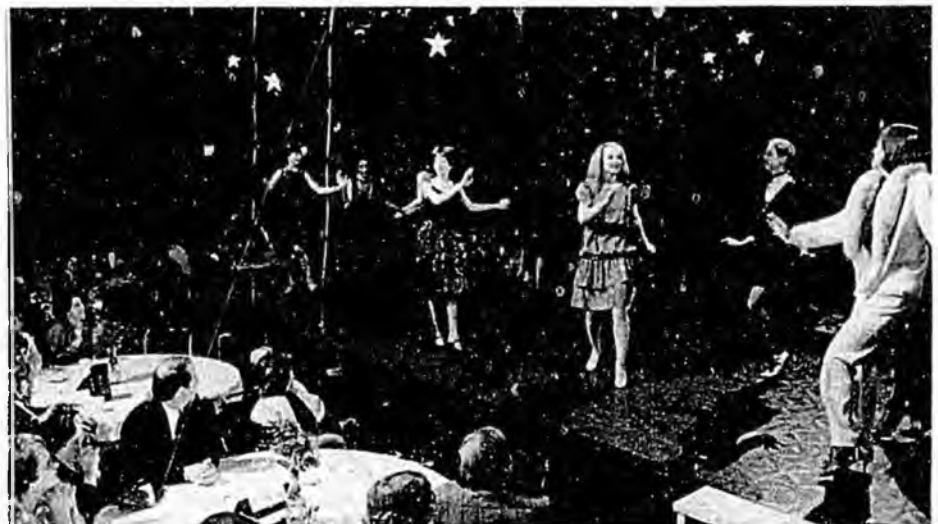
Putting on the Ritz—Dancers and models present the grand finale at University of Alaska-Juneau's annual fundraiser, Tuxedo Junction. Proceeds from the gala event go to UAJ's scholarship fund in the University of Alaska Foundation.