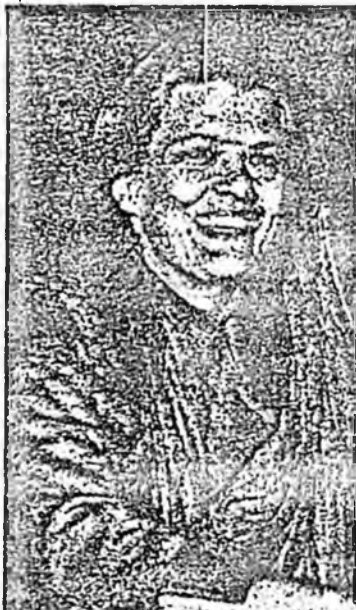
Laura X: "No state or national agency is documenting these cases."