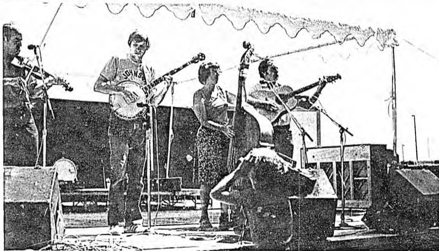
Update in Kansas City: ATC unit sponsored music to mark opening of system.

To find out the extent and variety of operators' public affairs projects, we looked at systems in various stages of maturity. The studies start with a recently completed system, since those under construction haven't had much time to produce a track record. For more information on how to pace marketing plans with build schedules, see "Building a Market While Building a System." TVC April 15, 1981, pp. 76-82.