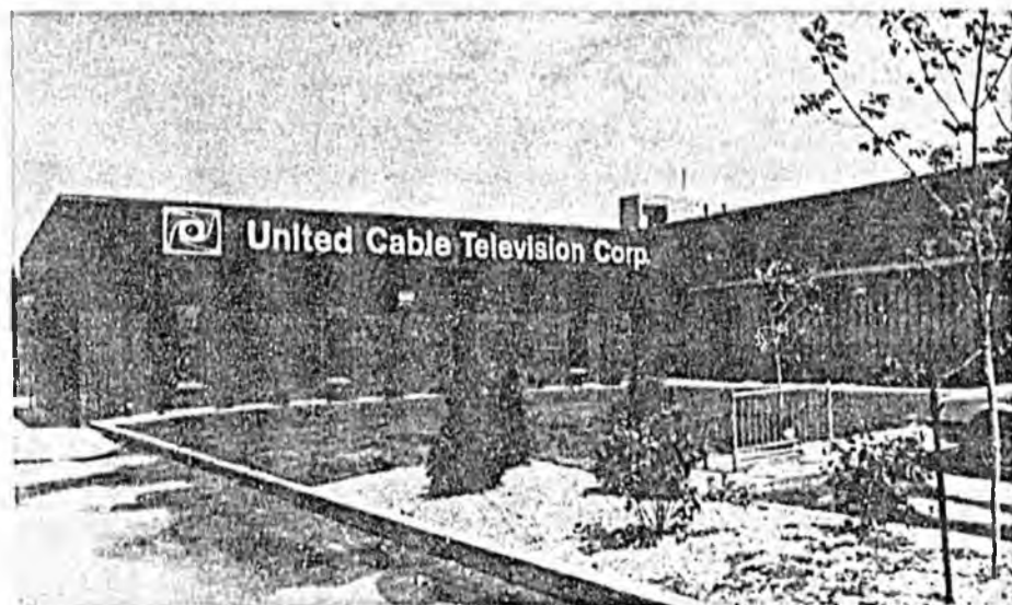
UCT's site in East Lansing: Local programming key area