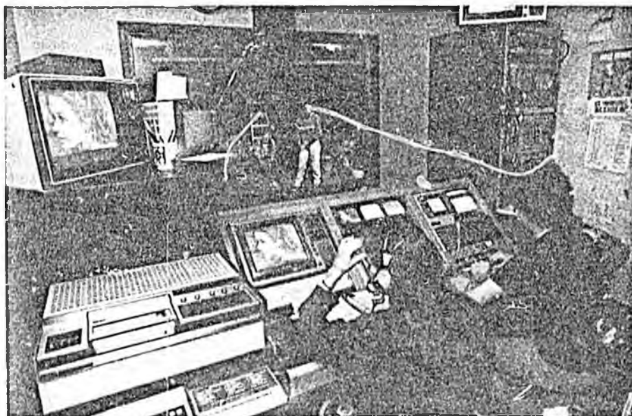
BCC and schools. System aired show produced by students