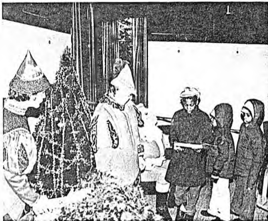
Christmas in Canton. Beppler's staff handing out toys to children