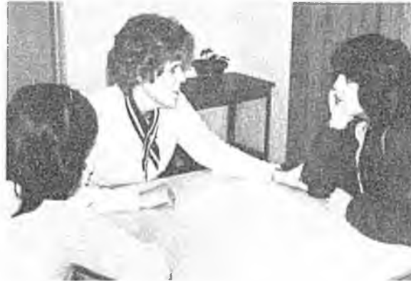
Troubled teens, ages 13-18, live together at Booth, sharing and learning about themselves, and continuing their education.