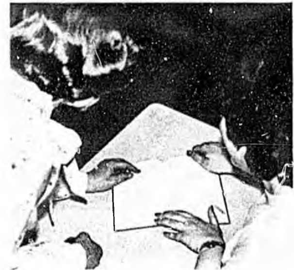
Pregnant teens continue their education at Booth through a special program with the Anchorage School District.

Young women who are accepted into the program become part of "the family." Booth becomes their home: it's where they live, go to school, and share their hopes, fears, frustrations and laughter with other residents. They participate in counseling, both group and individual sessions, for: personal and spiritual growth, family adjustment, and parenting. These young mothers have the primary responsibility for caring for their infants on a day-to-day basis. Skilled counselors provide emotional support, parenting classes, and help teens plan realistically for a healthy future.