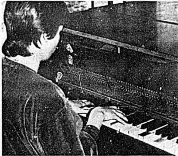
Teens in the residential program have regular activities and leisure time, as well as school and counseling.

Booth "family members" share their thoughts and plans with each other in the supportive living environment.