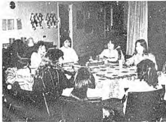
Pregnant teens, ages 13-18, live together at Booth, sharing, and learning about parenting, themselves, and continuing their education.