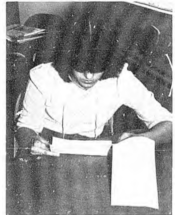
Pregnant teens continue their education at Booth through a special program with the Anchorage School District.

Young women who are accepted into the program become part of "the family." Booth becomes their home: it's where they live, go to school, and share their hopes, fears, frustrations and laughter with other residents. They participate in counseling, both group and individual sessions, for: maternity planning, personal and spiritual growth, family adjustment. They receive regular medical attention and take classes to prepare for childbirth.