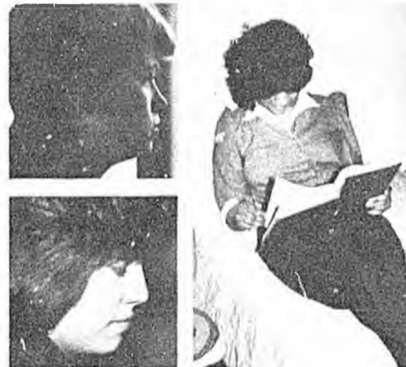
Single pregnant women and new mothers learn new skills and options through the Outpatient program.

Any single pregnant woman or new mother of any age. Participants in Booth's Outpatient Maternity program range from age 12 to 45. Each woman has something to gain from the program — each has something to give.