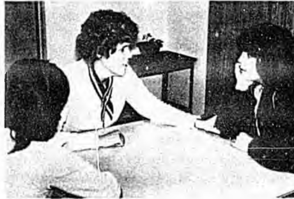
Troubled teens, ages 13-18, live together at Booth, sharing and learning about themselves, and continuing their education.