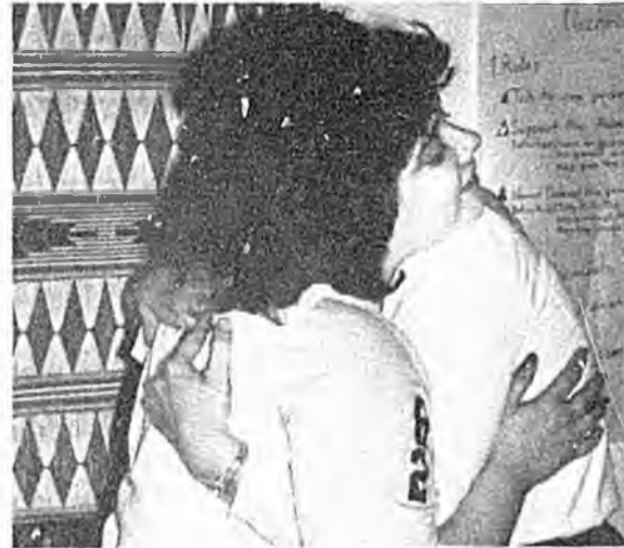
Single, pregnant women come together for support at Booth's Outpatient Maternity program.