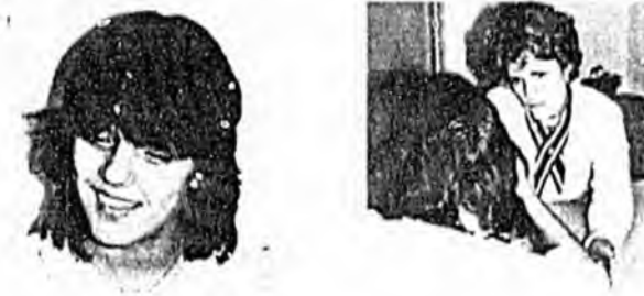
Adolescents at Booth work toward learning new, healthy behaviors and skills for a successful future.

Adolescent girls, 13-18 years old, who are in State custody because of their history of behavior difficulties such as: poor functioning in school, problems maintaining positive relationships, past drug or alcohol abuse, running away; family abuse, neglect and/or sexual abuse.