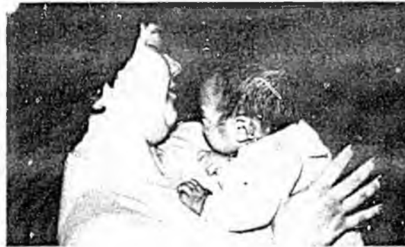
Teenage mothers, ages 13-18, live at Booth while their babies are infants. They learn parenting and life-coping skills and health behavior patterns.