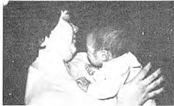
Teenage mothers, ages 13-18, live at Booth while their babies are infants. They learn parenting and life-coping skills and health behavior patterns.