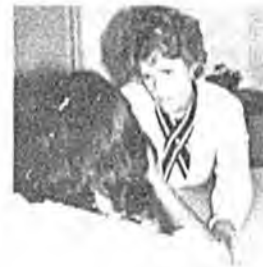
Adolescents at Booth work toward learning new, healthy behaviors and skills for a successful future.