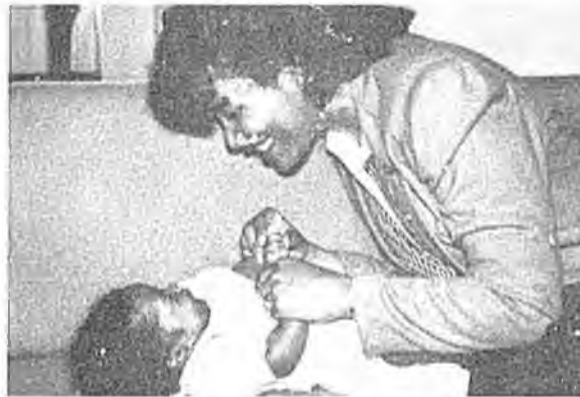
Teen mothers at Booth learn parenting and coping skills that will help them plan for their future and those of their children.

The young mother, 13-18 years old, who has one child under six months of age, and who wants a safe environment to test her decision to be a single parent. This teenager with few coping skills is generally at high risk for becoming abusive with the helpless, dependent child.