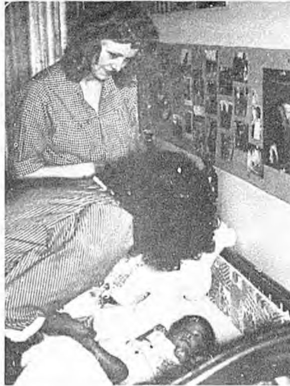
Outpatients gain skills during pregnancy to help prepare them for Baby's arrival.