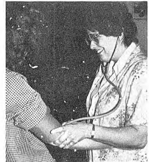
Booth's Maternity Outpatients receive a full range of medical, educational and support services.

Women who are accepted into the program come to Booth during the week for classes, counseling and medical checkups. They learn prenatal health care, and how to prepare for childbirth and parenting. Through counseling, they increase their decision-making skills and awareness of family dynamics. They provide support to their peers and develop new options for the future through educational and vocational planning. They are also exposed to other community resources and support groups, for assistance after they complete Booth's program.