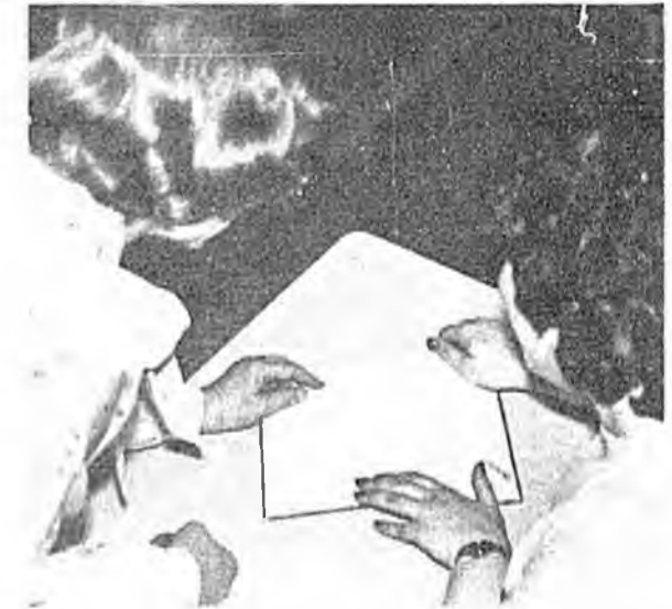
Pregnant teens continue their education at Booth through a special program with the Anchorage School District.

Young women who are accepted into the program become part of "the family." Booth becomes their home: it's where they live, go to school, and share their hopes, fears, frustrations and laughter with other residents. They participate in counseling, both group and individual sessions, for: personal and spiritual growth, family adjustment, and parenting. These young mothers have the primary responsibility for caring for their infants on a day-to-day basis. Skilled counselors provide emotional support, parenting classes, and help teens plan realistically for a healthy future.