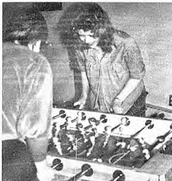
Teens awaiting their babies have regular activities and leisure time, as well as school and counseling.