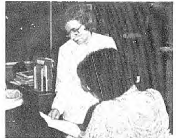
Troubled teens continue their education at Booth through a special program with the Anchorage School District.

Young women who are accepted into the program become part of "the family." Booth becomes their home: it's where they live, go to school, and share their hopes, fears, frustrations and laughter with other residents. They participate in counseling, both group and individual sessions, for personal and spiritual growth. They learn to change destructive behavior patterns into positive, rewarding ones. And, they develop new options for the future through educational and vocational planning. They're also exposed to other community resources and support groups, for assistance after they complete Booth's program.