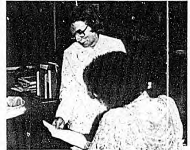
Troubled teens continue their education at Booth through a special program with the Anchorage School District.

Young women who are accepted into the program become part of "the family." Booth becomes their home: it's where they live, go to school, and share their hopes, fears, frustrations and laughter with other residents. They participate in counseling, both group and individual sessions, for personal and spiritual growth. They learn to change destructive behavior patterns into positive, rewarding ones. And, they develop new options for the future through educational and vocational planning. They're also exposed to other community resources and support groups, for assistance after they complete Booth's program.