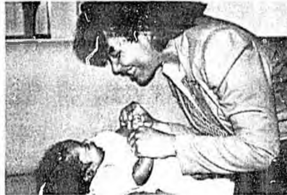
Teen mothers at Booth learn parenting and coping skills that will help them plan for their future and those of their children.

The young mother, 13-18 years old, who has one child under six months of age, and who wants a safe environment to test her decision to be a single parent. This teenager with few coping skills is generally at high risk for becoming abusive with the helpless, dependent child.