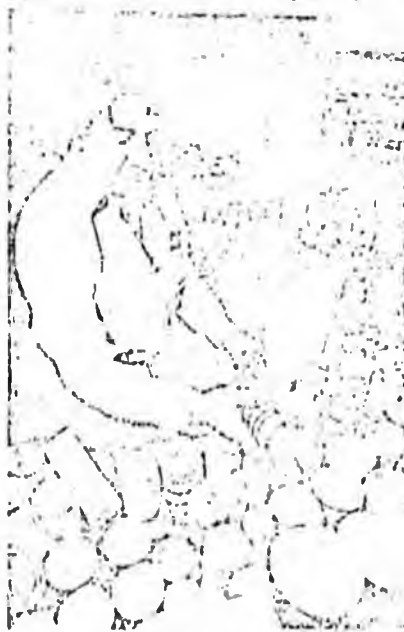
No shortage of takers

The entire system is private and non-profit seeking. To make sure it stays that way for tax purposes, Second Harvest certifies its member banks, inspects their operations, ensures that they charge no