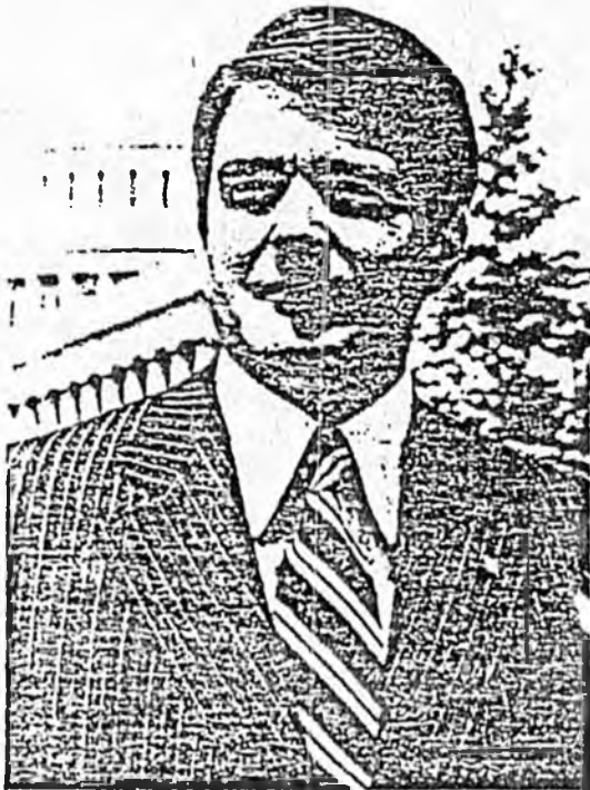
Rep. Larry McDonald (D-Ga)

CONGRESSIONAL RECORD — October 9, 1975 H 10015—H 10022