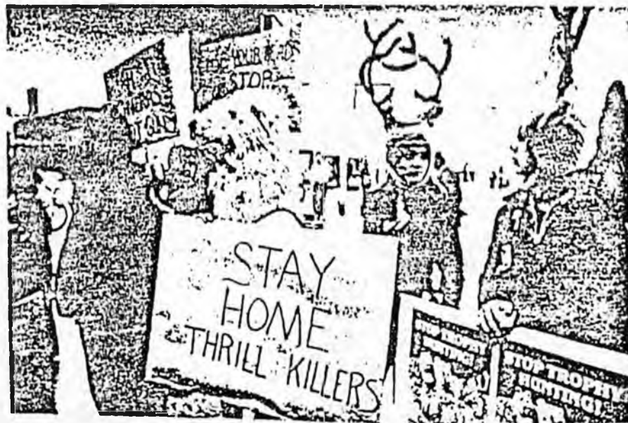
Illustration by Domenick D'Andrea

In the fall of 1980, the Gary Zechel hunting party camped in the Spatsizi wilderness in British Columbia and ran into harassment by eight Greenpeace agitators (left). When Zechel and his wife rode out of their camp for a day of hunting with their guide, the Greenpeaceers locked arms across the trail to block their way and screamed abuse. A female Greenpeaceer grabbed Zechel's reins to hold him back. The guide broke through the human barrier, and the Zechels pulled away and rode around them. Gary Zechel stated that his greatest fear was that one of the horses would spook and injure or kill someone. The painting is based on a photograph supplied by the Greenpeace organization! At right, Greenpeaceers in animal costumes harass Richard A. Mielke and Darryl Hastings in the Vancouver airport after their successful hunt.