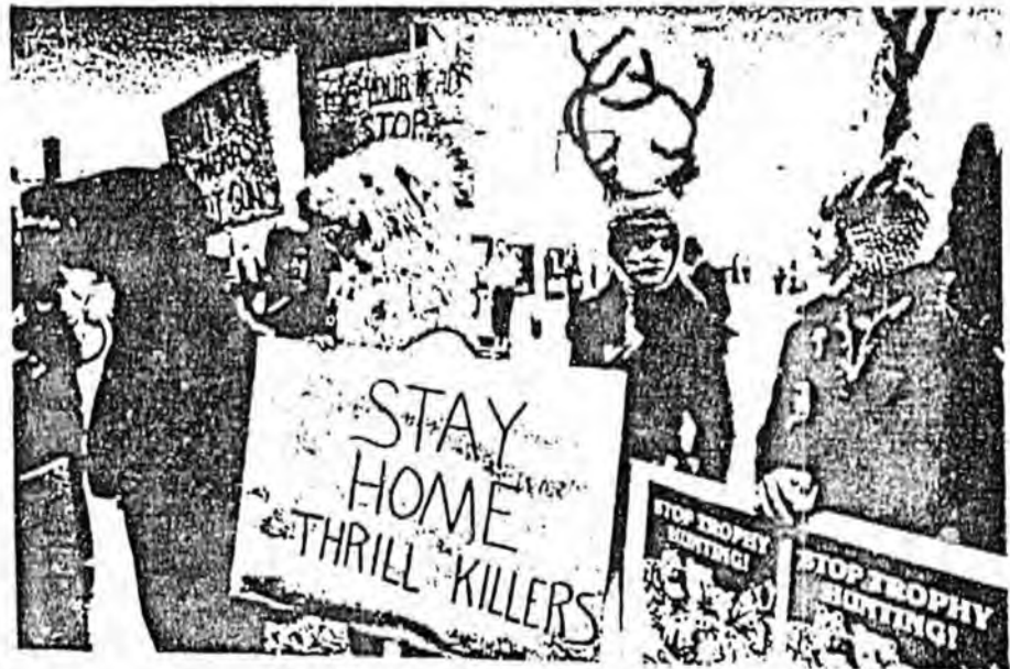
Illustration by Domenick D'Andrea

In the fall of 1980, the Gary Zechel hunting party camped in the Spatsizi wilderness in British Columbia and ran into harassment by eight Greenpeace agitators (left). When Zechel and his wife rode out of their camp for a day of hunting with their guide, the Greenpeacers locked arms across the trail to block their way and screamed abuse. A female Greenpeacer grabbed Zechel's reins to hold him back. The guide broke through the human barrier, and the Zechels pulled away and rode around them. Gary Zechel stated that his greatest fear was that one of the horses would spook and injure or kill someone. The painting is based on a photograph supplied by the Greenpeacer organization! At right, Greenpeacers in animal costumes harass Richard A. Mielke and Darryl Hastings in the Vancouver airport after their successful hunt.