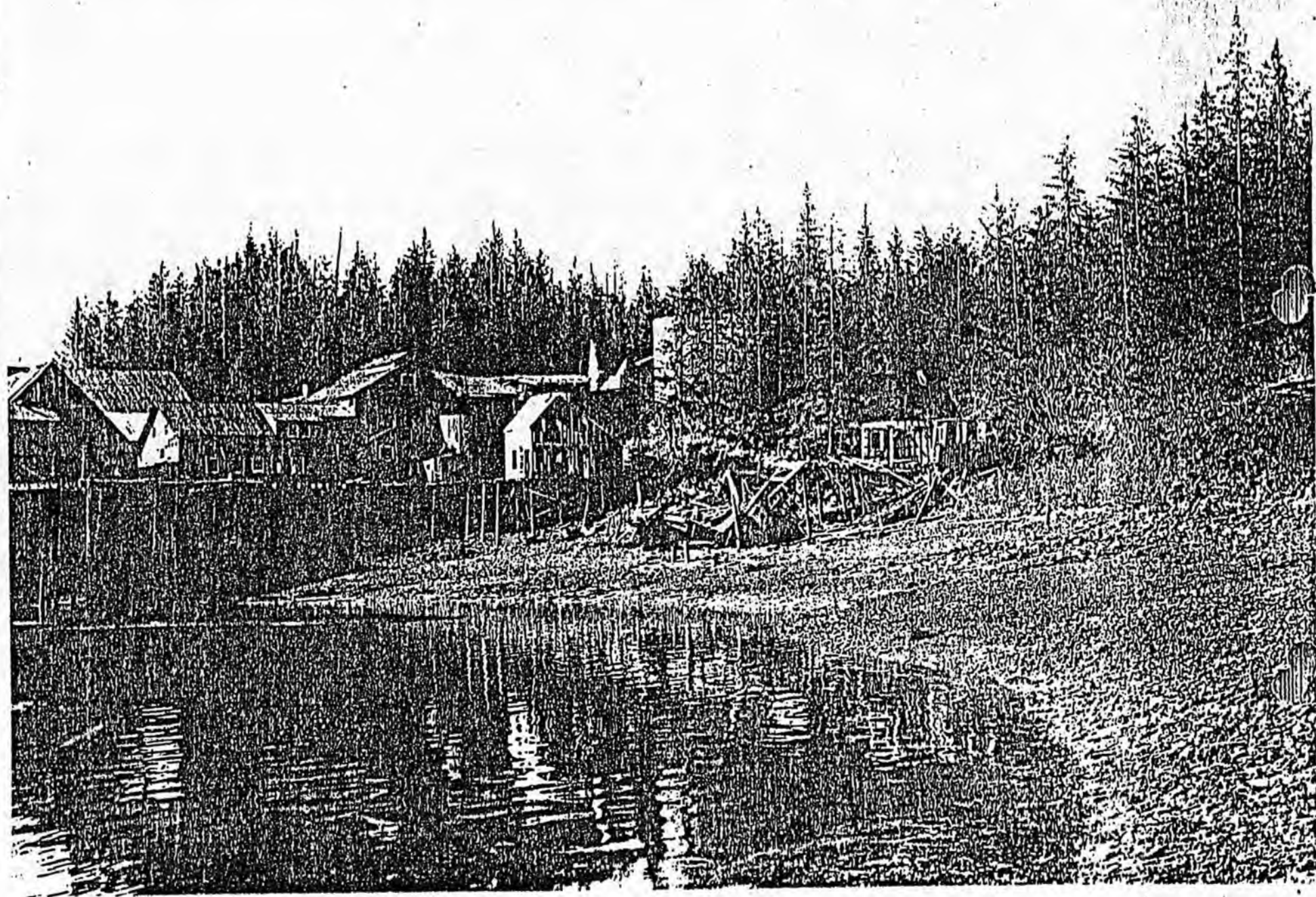
PHOTO #3. Cannery damaged during and abandoned after 1964 earthquake (uplift in area 8 to 9 feet).