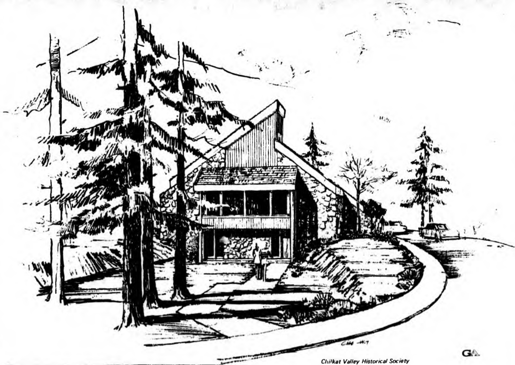
THE SHELDON MUSEUM AND CULTURAL CENTER

Chilkat Valley Historical Society Haines, Alaska