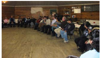
Circle Sentencing, Huslia.

Second, we have continued to work closely with the Alaska Native community to foster more collaborative, community-based mechanisms of justice delivery across the state. Native leaders have long