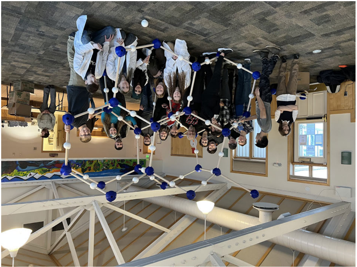
Helping Acceleration Academy students build a 3D ice lattice structure at the Campbell Creek Science Center - 2022.