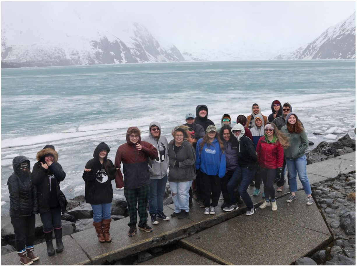
Teaching students about snow science and glacier formations at Portage Lake, AK - April 2023 (Photo Courtesy of Allison Heaslet).