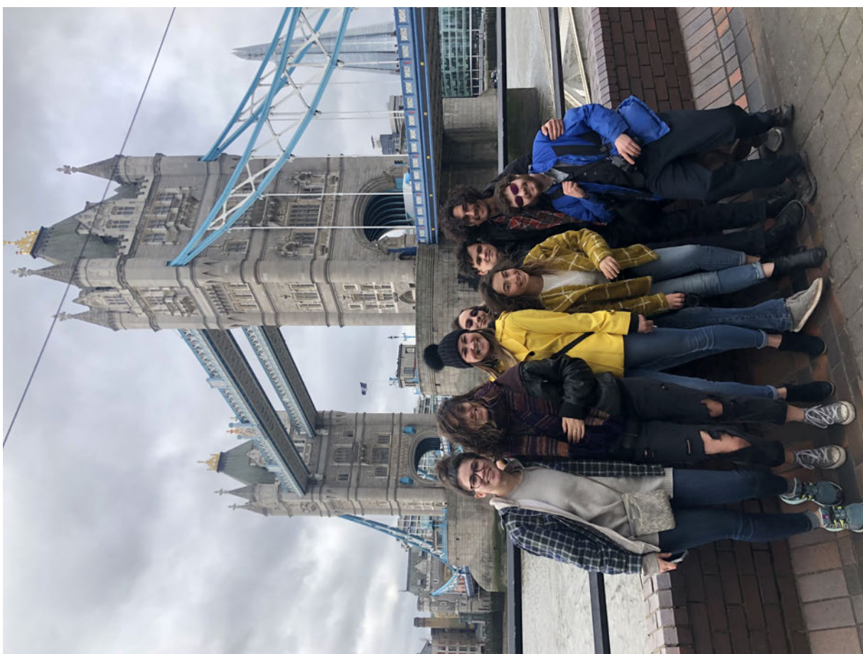
Eight ANSEP University Success friends travel to London for Spring Break - some long lasting relationships from attending Acceleration Academy in 2014! March, 2019.