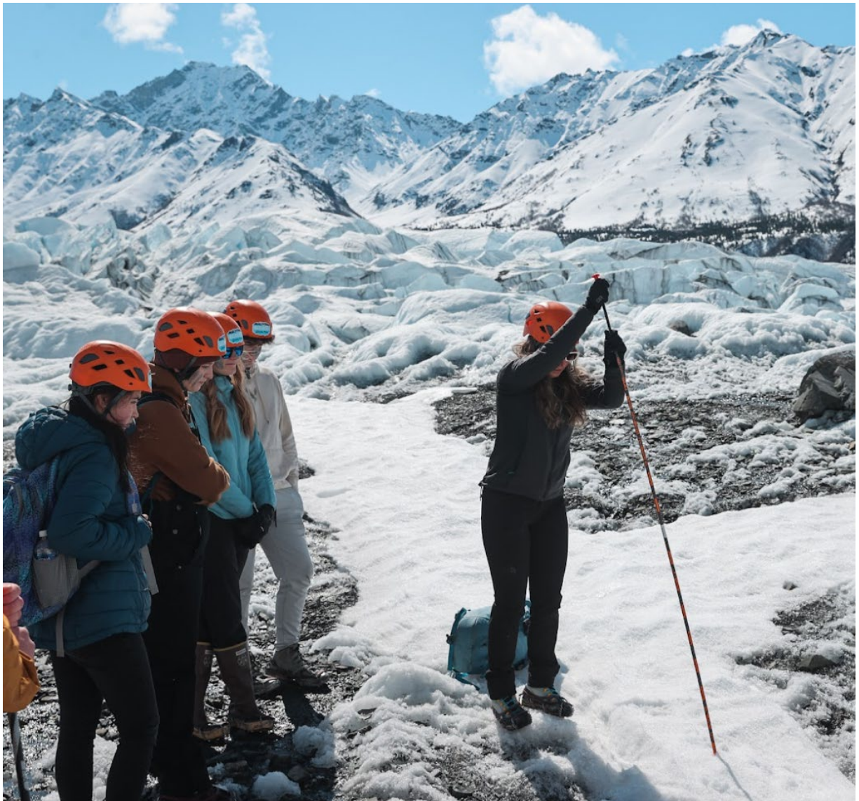
Showing Acceleration Academy students how deep glacier crevasses are, Matanuska Glacier, May 2024.