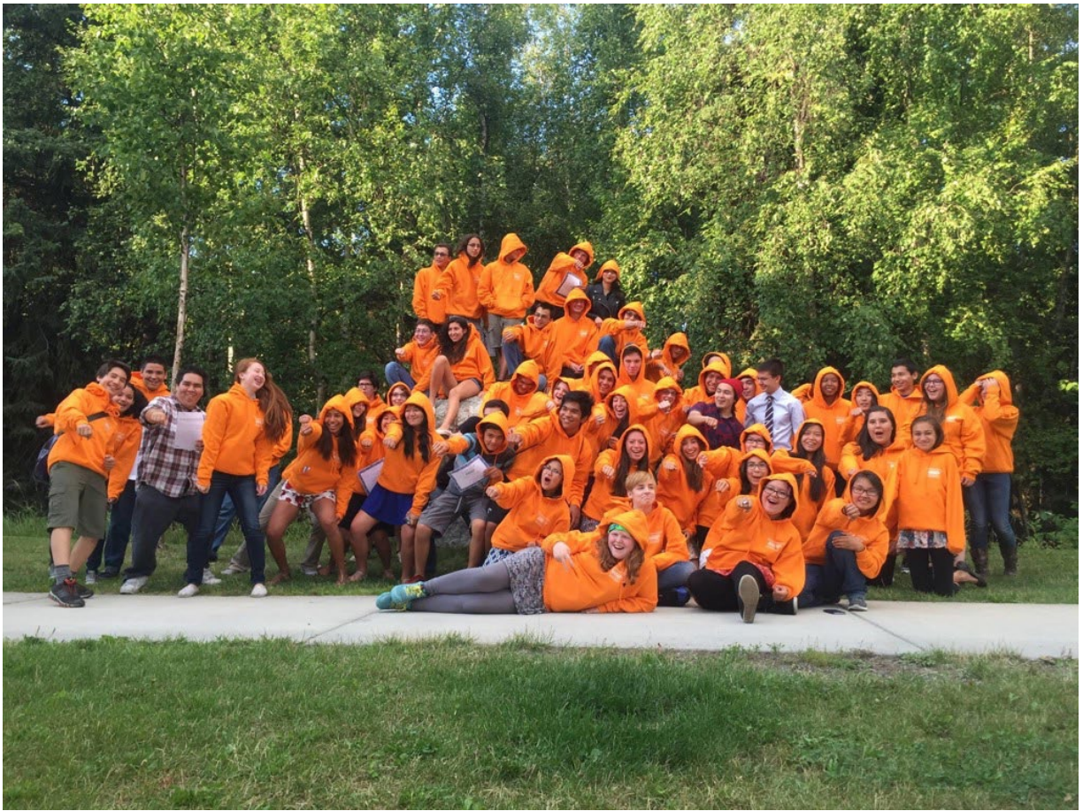
Acceleration Summer Academy 2015 - my second year with ANSEP!