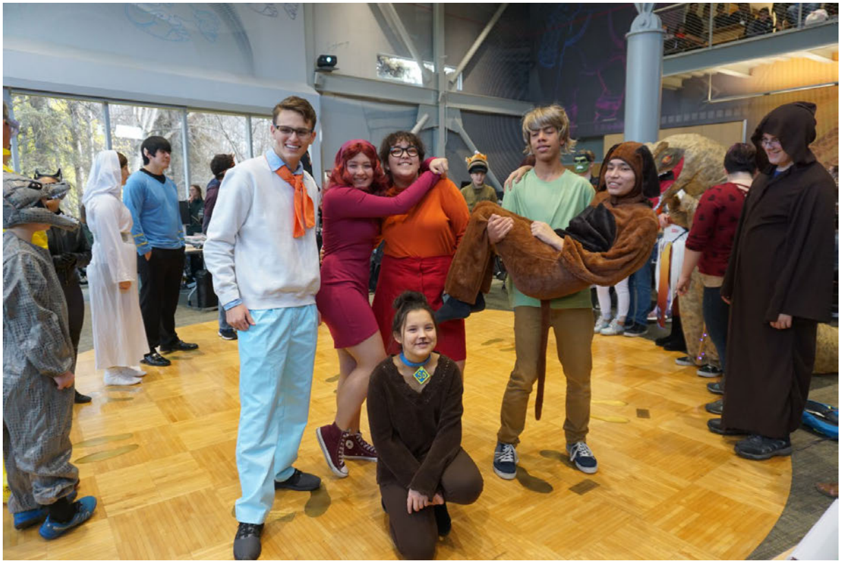
Halloween costume competition during ANSEP Acceleration High School's first semester in Anchorage - Fall 2018.