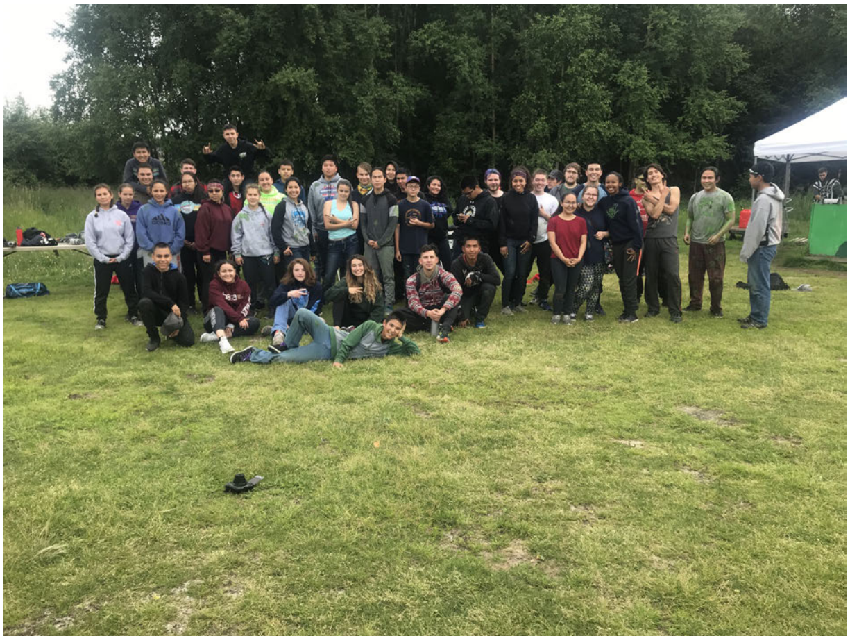
Working with ANSEP Acceleration high school students in 2017.