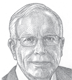
James J. Heckman is the Henry Schultz Distinguished Service Professor of Economics and Director of the Center for the Economics of Human Development at the University of Chicago, a Nobel Laureate in economics and an expert in the economics of human development.