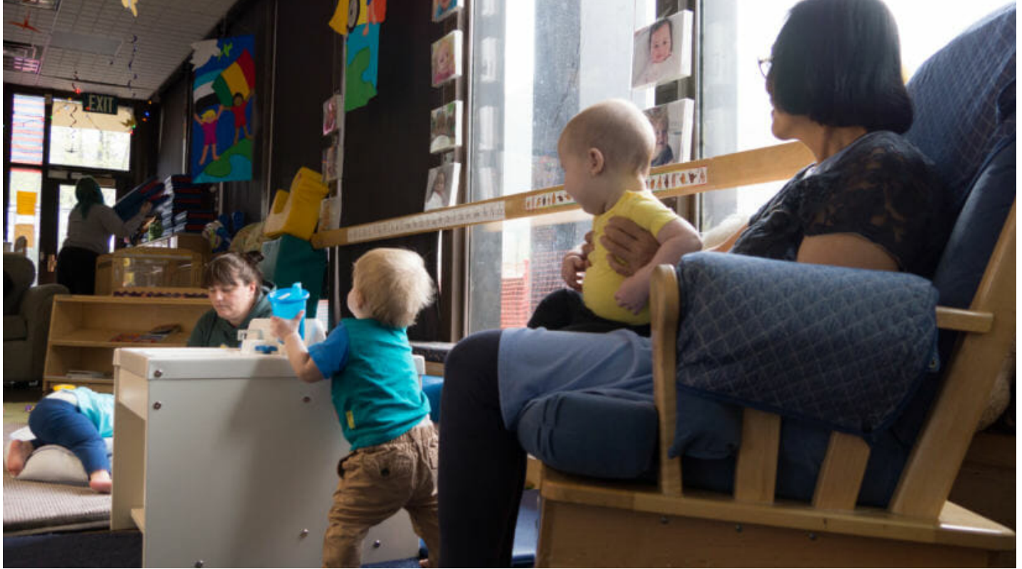
Childcare workers interact with infants at Gold Creek Child Development Center in Juneau on May 11, 2018.

Two of Juneau's childcare centers are closing after months of trying to hire new administrators. The closures will worsen Juneau's <u>shortage of childcare options</u>, particularly for infants and toddlers.