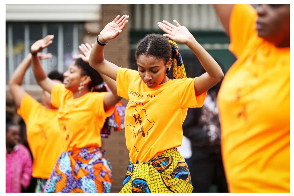
Performers during the 48th Annual Juneteenth Day Festival in Milwaukee, Wisconsin, on June 19, 2019.

In 2020, corporations pledged to be anti-racist and many recognized Juneteenth as a company holiday. Cities also took steps to specifically recognize Juneteenth at the municipal level. For example, Philadelphia, the site of one of the country's largest Juneteenth parades, passed an executive order designating Juneteenth as an official city holiday for 2020. "This designation of Juneteenth represents my administration's commitment to reckon with our own role in maintaining racial inequities and our understanding of the magnitude of work that lies ahead," said the city's mayor, Jim Kenney .