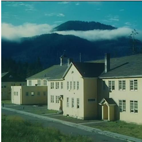
Wrangle Institute Wrangle