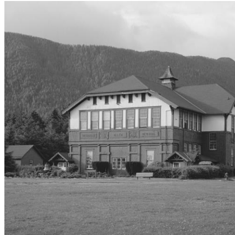
Sheldon Jackson College Sitka