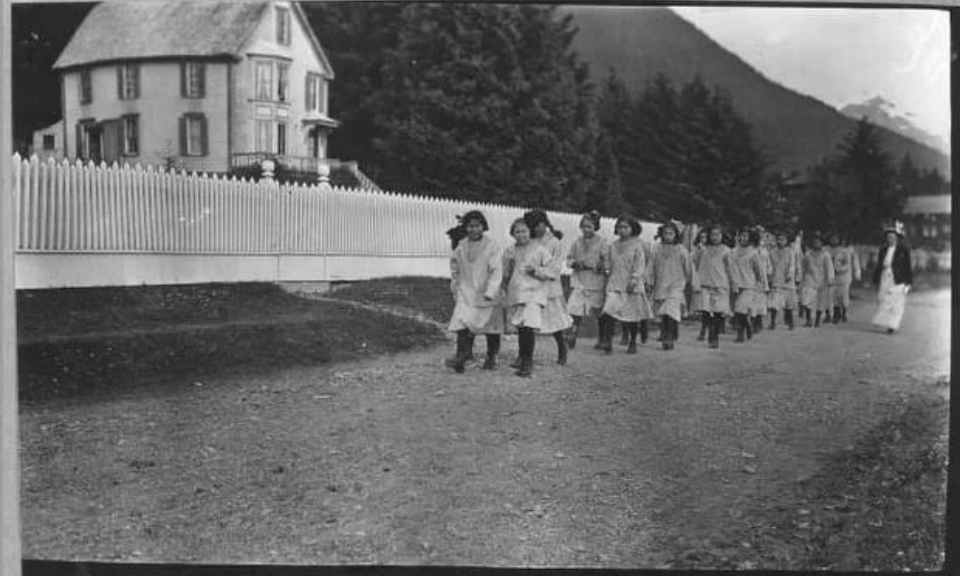
Indian Children from the Sheldon Jackson School, Sitka