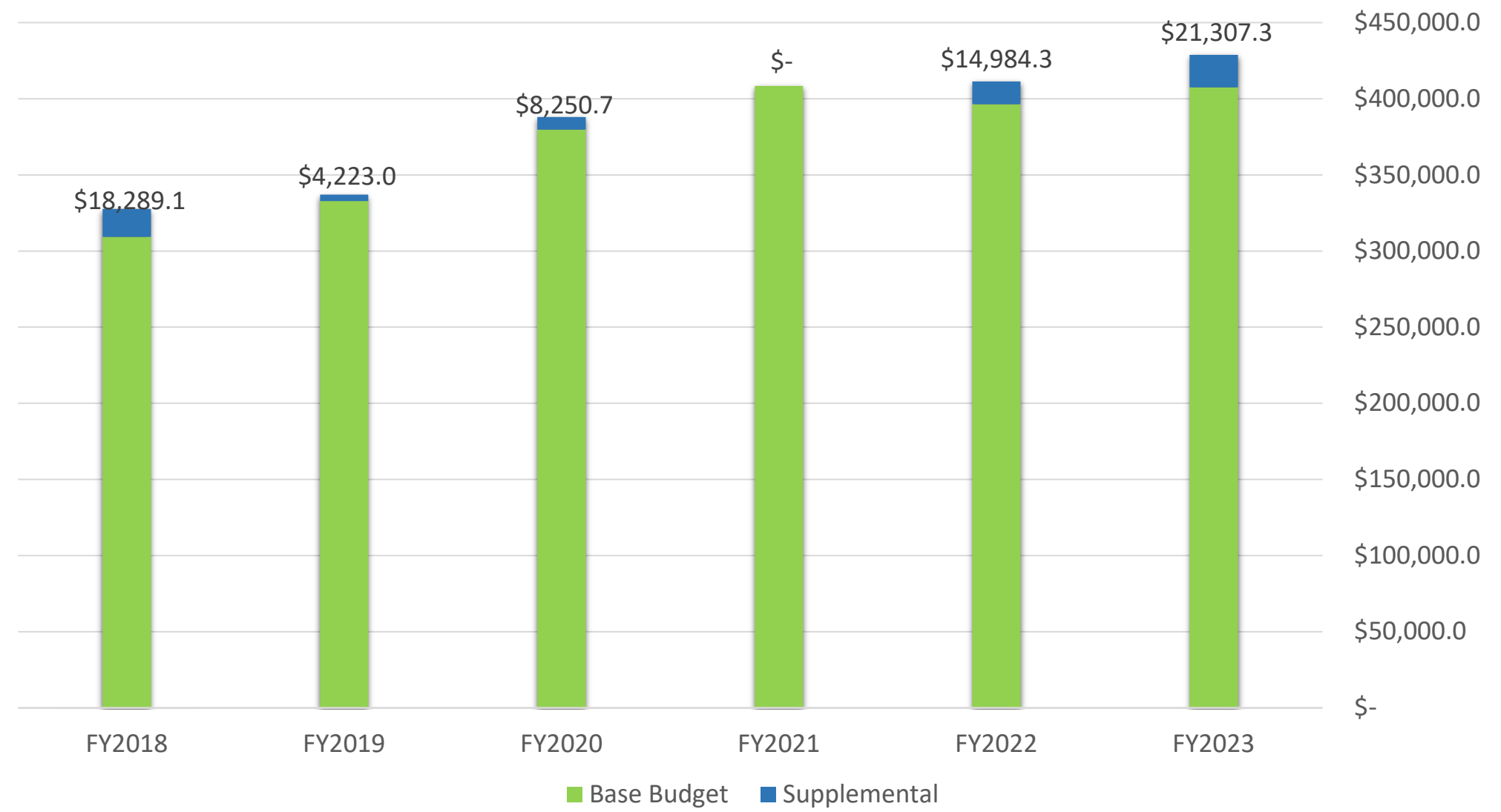
Department of Corrections Operating Supplemental Budget History

Capital Supplemental: Lemon Creek Correctional Center renovation and repair $8.3 million UGF and $1.2 million other state funds.