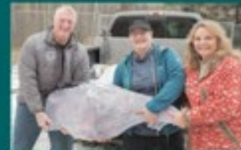
Moose meat donation to Alaska Native Medical Center traditional foods program.

I have seen patients not feeling well and grimacing in pain take a bowl of bone broth and you can see them visibly relax. It makes them feel better. Our traditional foods program is important for patients' quality of life. It has been even more important with Covid-19 when patients have little or no access to loved ones. Eating a traditional food makes them feel better. Patients have said it tastes like home. -Chef, Alaska Native Medical Center