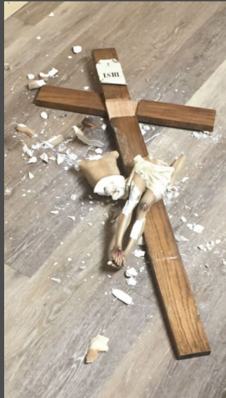
The Alaska Shepherd. "A New Church for Chefnak." A Publication of the Catholic Bishop of Northern Alaska. December 2022