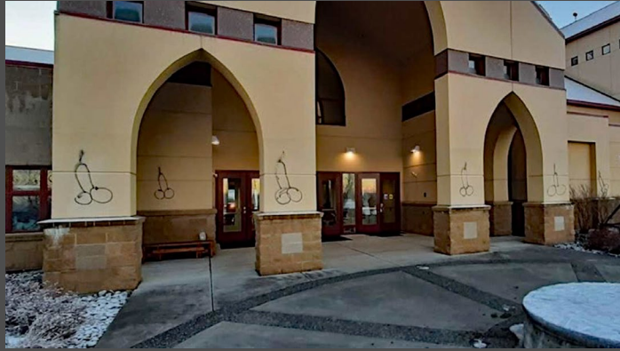
The Alaska Watchman. "Eagle River church vandalized again with phallic symbols." November 25, 2022.