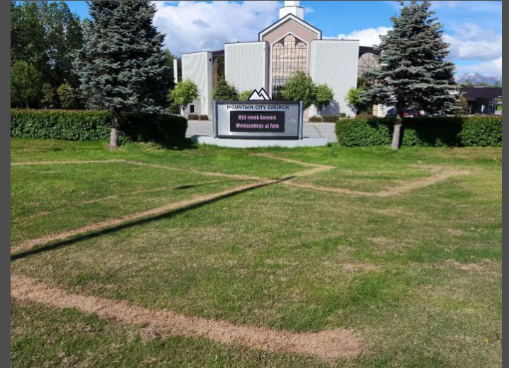
Must Read Alaska. "Vandals burn chemical swastika into lawn of Mountain City Church." June 14, 2023.