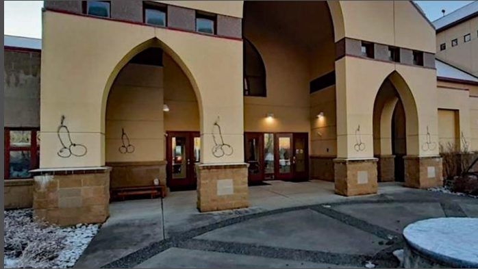
The Alaska Watchman. "Eagle River church vandalized again with phallic symbols." November 25, 2022.