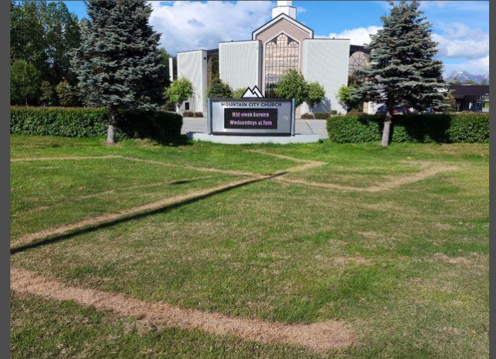
Must Read Alaska. "Vandals burn chemical swastika into lawn of Mountain City Church." June 14, 2023.