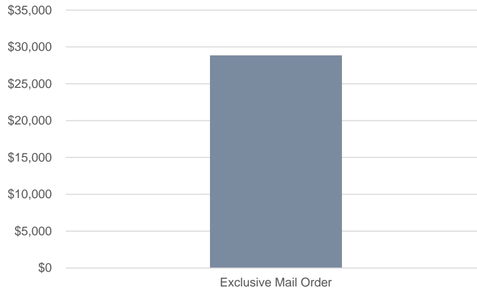
Mail Order Pharmacy Contract Loss