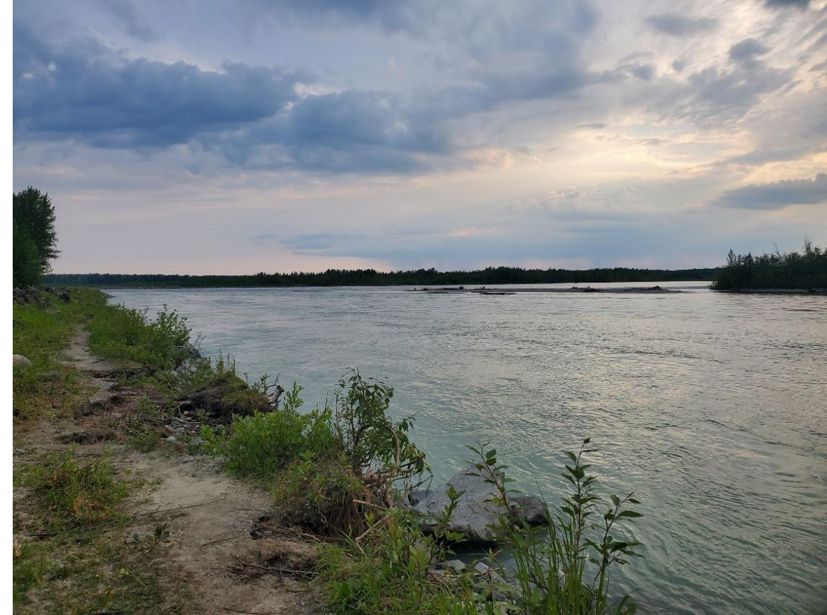
Talkeetna River