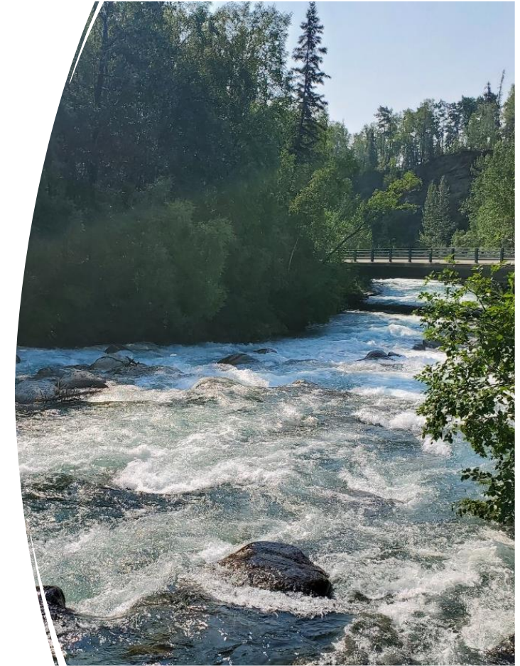
Talkeetna River