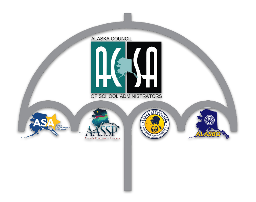
Alaska Council of School Administrators

Leadership, Unity and Advocacy for Public Education