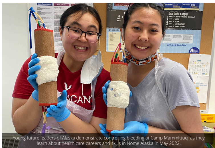
Young future leaders of Alaska demonstrate controlling bleeding at Camp Mammittuq as they learn about health care careers and skills in Nome Alaska in May 2022.

We believe that funding, as a state appropriation to the University of Alaska, directed to the Alaska AHEC program, would systemize statewide health care workforce development initiatives.