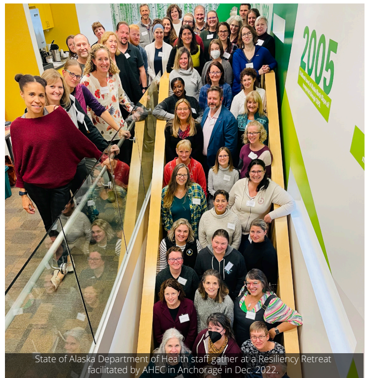
State of Alaska Department of Health staff gather at a Resiliency Retreat facilitated by AHEC in Anchorage in Dec. 2022.