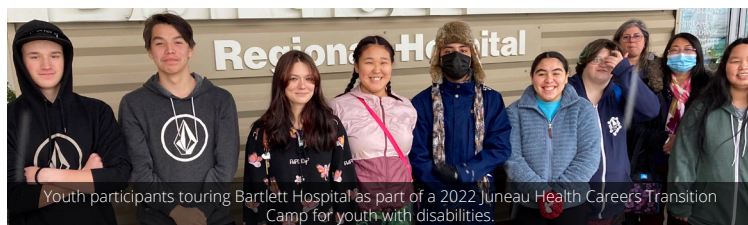
Youth participants touring Bartlett Hospital as part of a 2022 Juneau Health Careers Transition Camp for youth with disabilities.

These strategies, when orchestrated systemically across education, industry and government partnerships, streamline efforts toward a sustainable health care workforce for the state of Alaska.