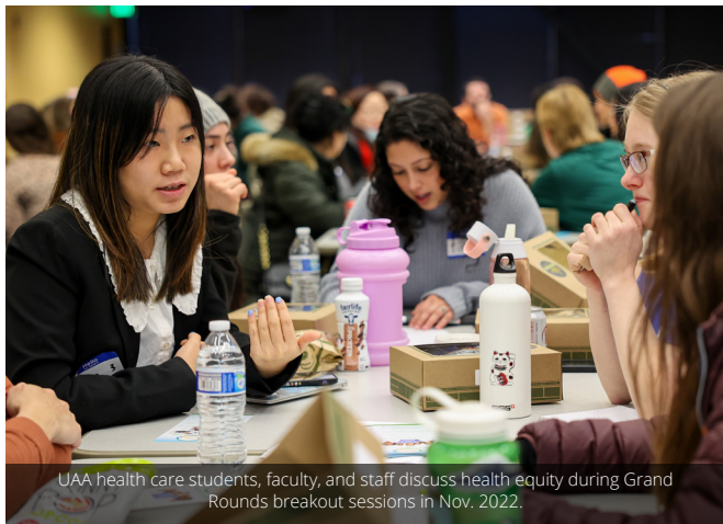
UAA health care students, faculty, and staff discuss health equity during Grand Rounds breakout sessions in Nov. 2022.