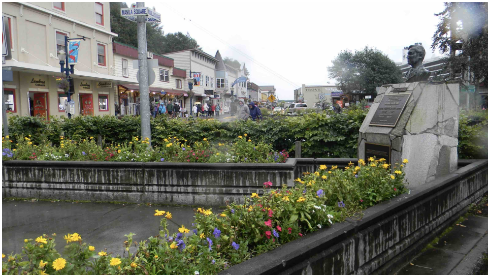
Manila Square in Juneau, Alaska.

Discrimination still targeted the Alaskeros, who were technically US citizens, as an effect of the American occupation in the Philippines. Segregation, for the most part, was glaring between white workers and other ethnicities such as Native Americans and Alaskans.