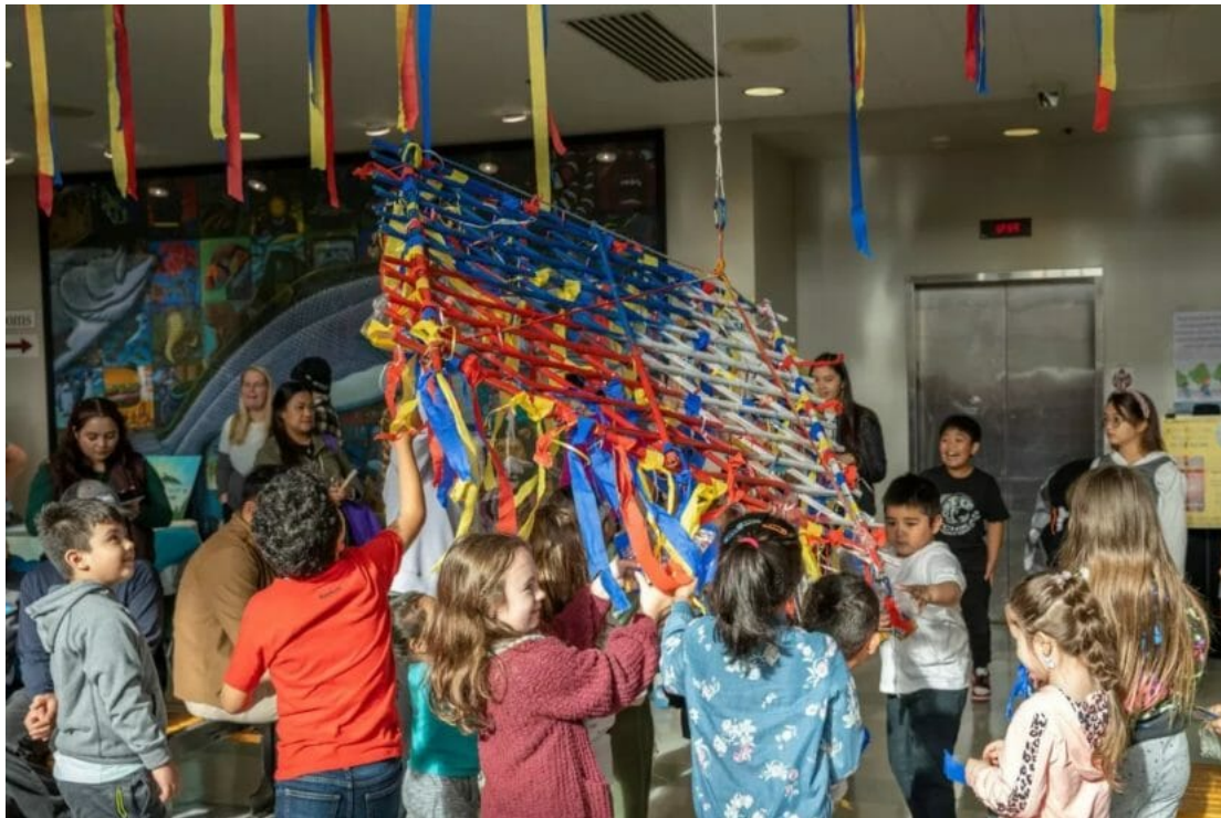
Children grab for goodies attached to a pabitin at Ketchikan's Fil-Am Festival on Oct. 15.

Community members in Ketchikan came together last weekend to celebrate Filipino American History Month at the second annual Fil-Am Festival. The event recognizes the contributions and history of Filipino Americans in Ketchikan and around the country.