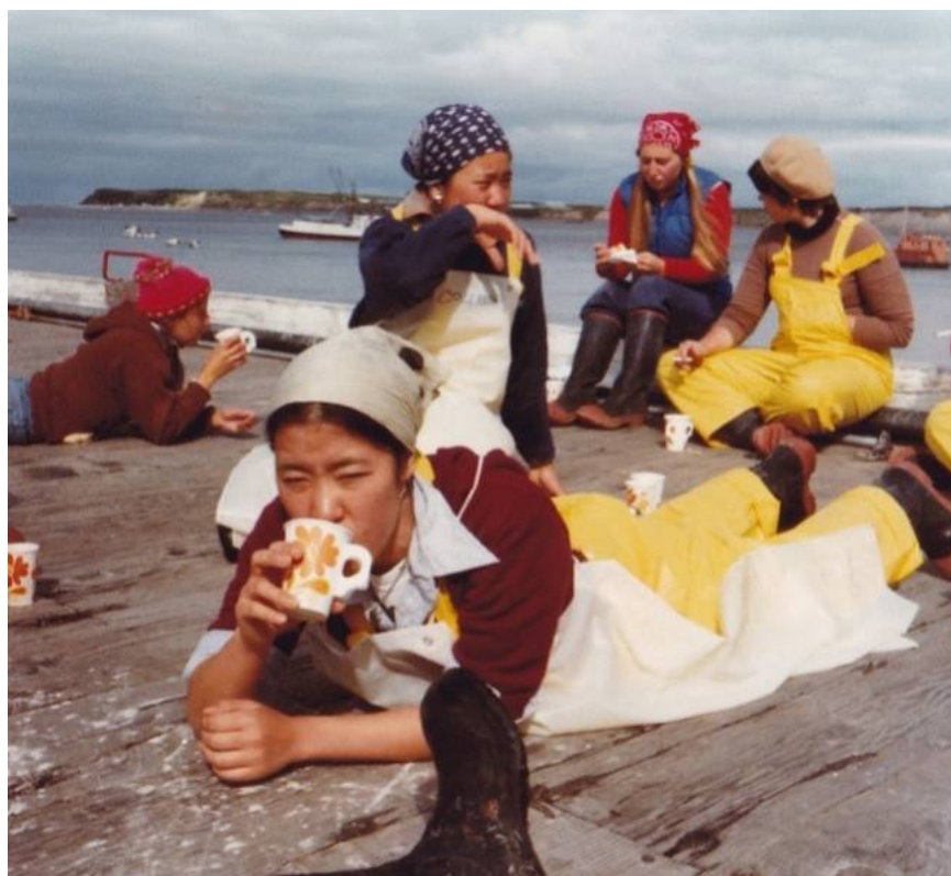
Cannery workers gather on the Diamond NN Cannery dock for a “mug up” in ca. 1976. Mug Up or coffee break gave cannery workers a 15-minute reprieve from the monotony of slime line work and canning machines.