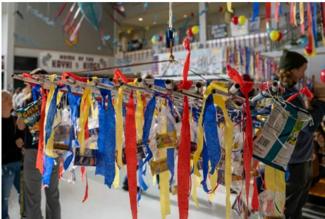
A pabitin awaits its time in the spotlight at Ketchikan's 2022 Fil-Am Fest.

It's called a pabitin — it's a little like a Filipino piñata, except instead of swinging a stick at a papier-mache animal, kids jump to grab the goodies dangling from the structure. Children gather round.