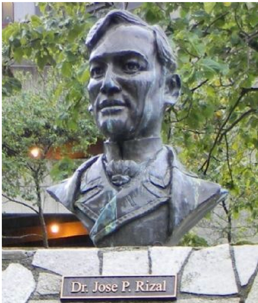
A bust of Rizal at Manila Square.

It was a legacy that was honored by the city and borough of Juneau in 2002, when it dedicated a location in the capital's downtown area and named it Manila Square.