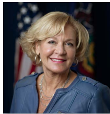
Sen. Lisa Boscola