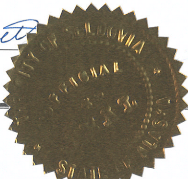
Jeremiah Campbell, Mayor

Jeremiah D. Campbell (Mar 15, 2023 4:50:01 AKDT)