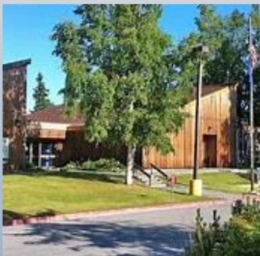
Hiland Mountain Correctional Center Transformational Living Community